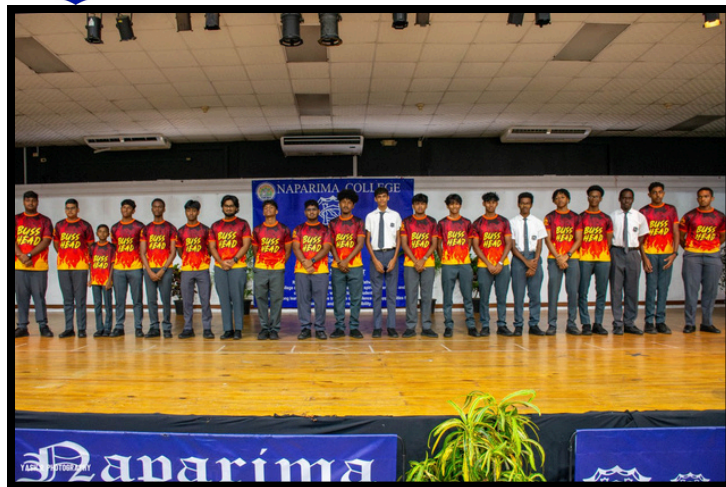
NAPS Combined Steel Orchestra